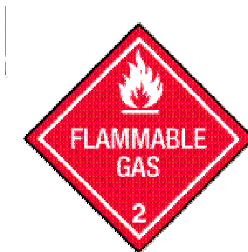
FIGURE 2.1. PLACARD INDICATING FLAMMABLE GAS

As previously mentioned, placards are diamond-shaped (square-on-point) signs that are used to identify shipments of hazardous materials. When required, placards must be placed on both ends and both sides of trucks, railcars, and intermodal containers that carry hazardous materials. They are coded by color and contain symbols and numbers that designate the hazard class or division of the hazardous material that is being shipped. For bulk and certain non-bulk shipments, a four-digit hazardous material identification number may be on the placard or on an accompanying orange panel or a white square-on-point sign. As an illustration, Figure 2.1 shows the placard for flammable gas (white letters on a red background).